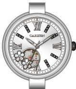
Scale 1.5 : 1