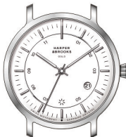
Scale 1.5 : 1