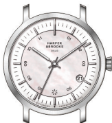
Scale 1.5 : 1