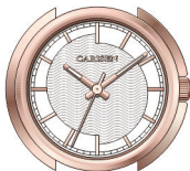
Scale 1.5 : 1