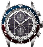
Scale 1.5 : 1