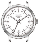
Scale 1.5 : 1