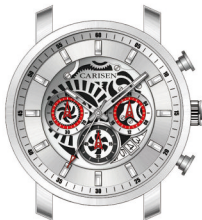
Scale 1.5 : 1