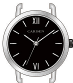
Scale 2 : 1