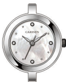
Scale 2 : 1