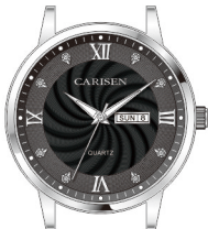
Scale 1.5 : 1