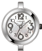
Scale 2 : 1