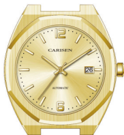
Scale 1.5 : 1