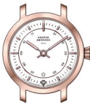
Scale 1.5 : 1