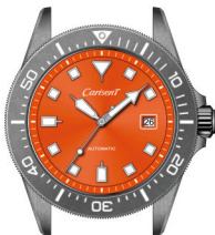
Scale 1.5 : 1