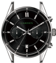
Scale 1.5 : 1