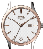
Scale 1.5 : 1