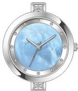
Scale 2 : 1