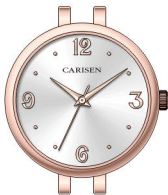
Scale 2 : 1