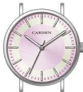
Scale 1.5 : 1