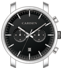
Scale 1.5 : 1