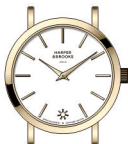
Scale 1.5 : 1