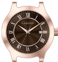
Scale 1.5 : 1