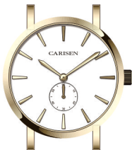
Scale 1.5 : 1