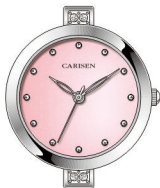
Scale 2 : 1