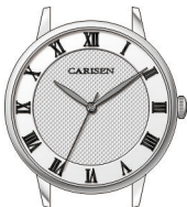
Scale 1.5 : 1