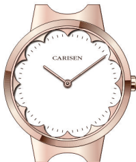
Scale 1.5 : 1